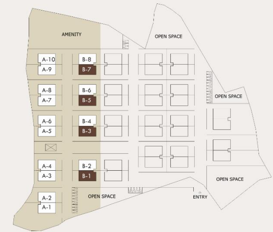
'Phase - 1' Key Plan