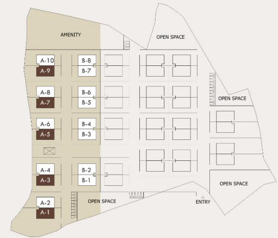
'Phase - 1' Key Plan